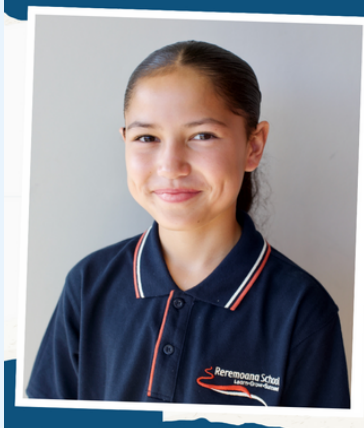
3 words to describe me as a leader Motivating, respectful and inclusive.

describe me As someone trustworthy, someone they can depend on, approachable, and takes initiative for any changes that need to be done to improve our school community. My motto in life is to be proactive and not reactive.