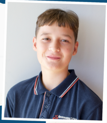
3 words to describe me as a leader

I really enjoy sports and am broud of being about of the sports community at Reremoana school.