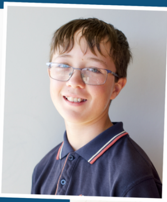
3 words to describe me as a leader